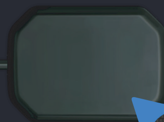
Tough Polyetherimide Thermoplastic

Even the replaceable cable is customized so patients bite on the positioner, not the cable. We performed an insane amount of tests to prove the longevity for every millimeter of the sensor, then we had them dentist verified.