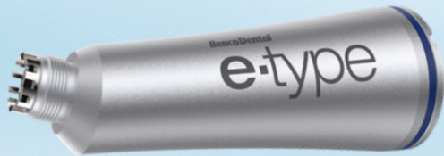
Sheath 1:1 [4113-915]