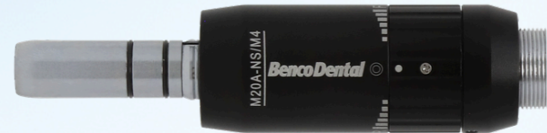
20,00 r.p.m. Motor [4104-194]