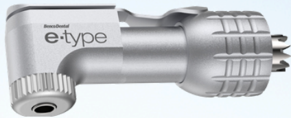
Spring Latch Head [4104-345]