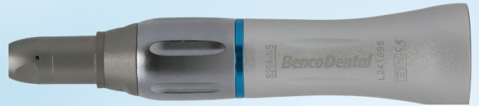
Nose Cone 1:1 [4104-309]