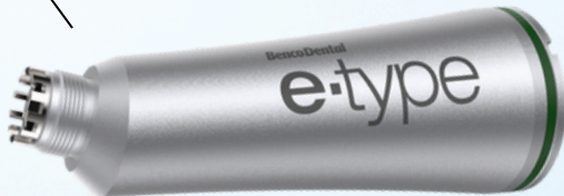
Sheath 4:1 [4104-336]