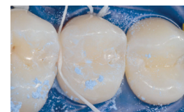
Professional tooth cleaning