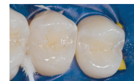
Cleaning with sodium hypochlorite