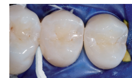
Apply CURODONT™ REPAIR FLUORIDE PLUS. The solution spreads around the contact points and diffuses deep into the body of the lesions.

“CURODONT™ REPAIR FLUORIDE PLUS — The first step in life-long integrity of our patient’s teeth.,,