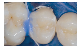
Enamel etching with phosphoric acid gel. Unwaxed dental floss is suitable for distributing the gel in the interdental spaces.